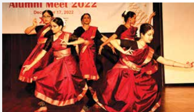
A dance performance as part of the Celebrations