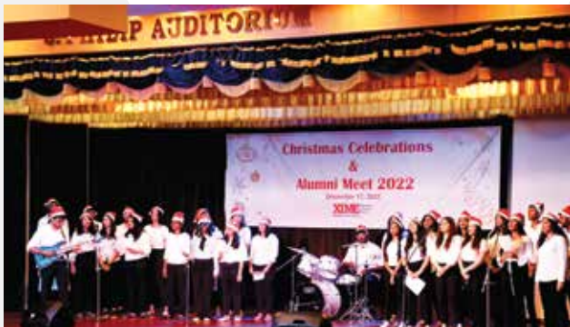
Choir singing Carol