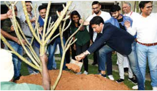
Tree planted to symbolize the registration of XIME Alumni Association