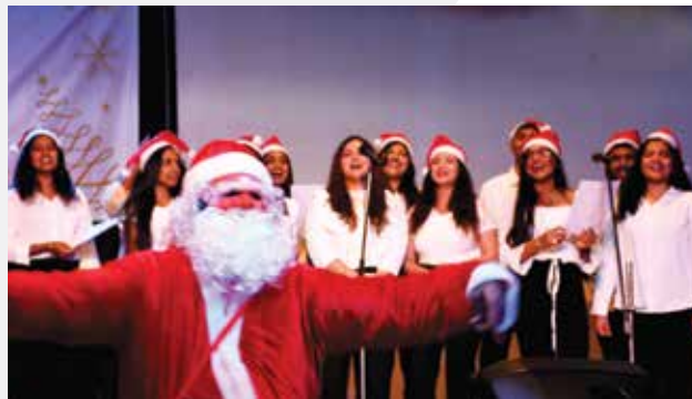
Santa and the choir